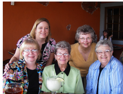
Women's Networking at

I look forward to seeing you in October - put it in your PDA - your planner - your calendar - on your refrigerator.